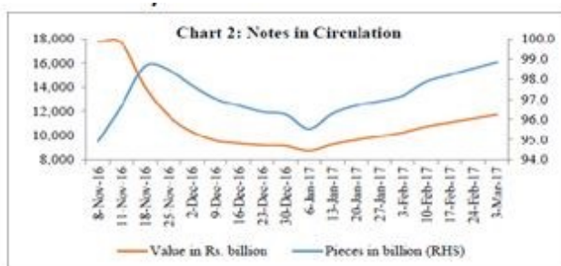
Chart 2: Currency in Circulation in India

15.44 lakh crore constituted Rs 500 and Rs 1000 notes which were invalidated, leaving only about Rs 3 lakh crores, which gave a shock treatment to the businesses and affected normal business transactions. The economy was therefore remonetized with new Rs.2000, Rs. 500 and Rs. 200 notes. However, even after demonetization, the total currency under circulation has come down considerably to Rs 15.32 lakh crore which is lower by over Rs 3 lakh crore before pre-demonetization and works out to about 9 per cent of GDP and appears to be a more sustainable level. This has helped in taming the inflation as well.